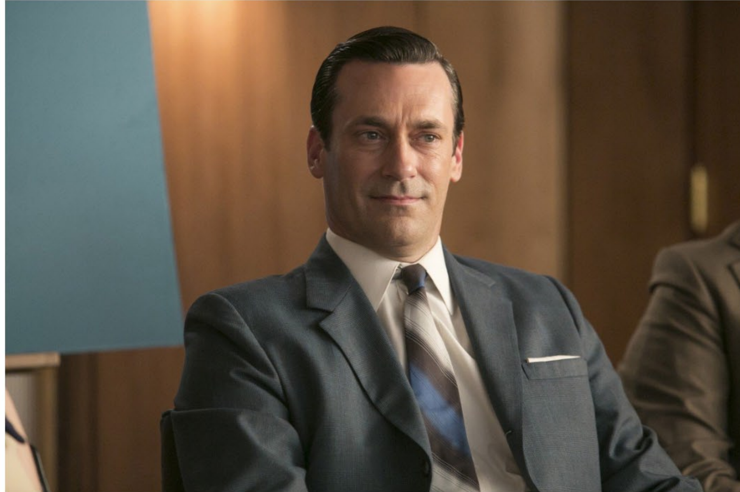
Dashing Don Draper, played by actor John Hamm, in one of his signature fine-cut suits from the 1960s-set television series, Mad Men.